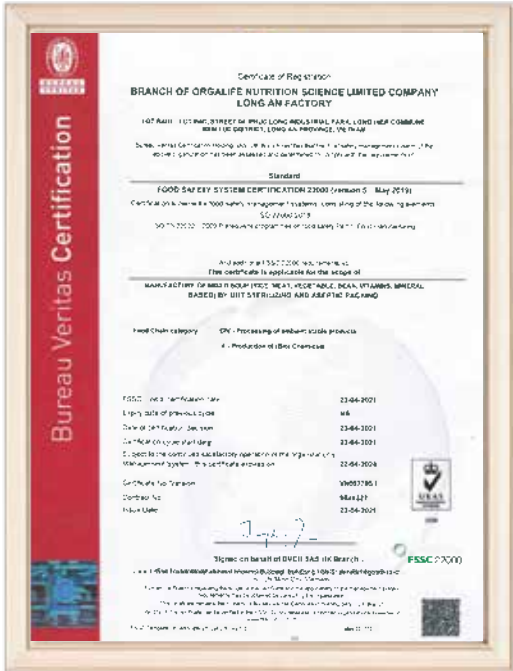
Food safety quality management system in compliance with European standards FSSC 22000.