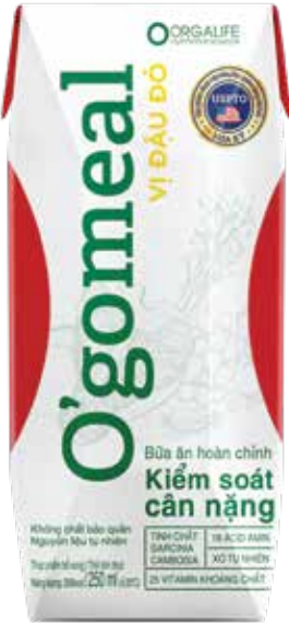
O'gomeal Red Bean Taste Food Supplement