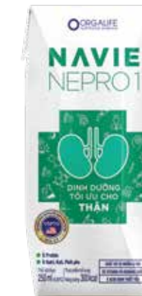
Navie Nepro 1 Food Supplement (before hemodialysis)