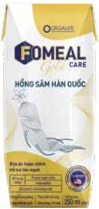
Fomeal Care Gold Korean Red Ginseng Food Supplement