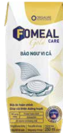
Fomeal Care Gold Abalone and Shark Fins Food Supplement