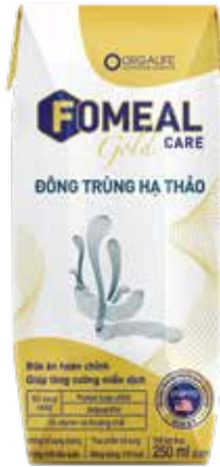
Fomeal Care Gold Cordyceps Food Supplement