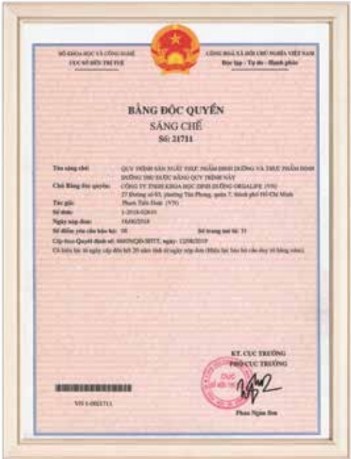
Patent granted by the National Office of Intellectual Property of Vietnam (NOIP Vietnam).