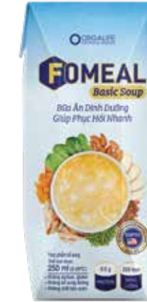
Fomeal Basic Soup Food Supplement