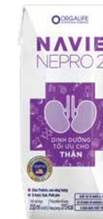
Navie Nepro 2 Food Supplement (after hemodialysis)