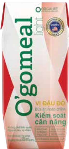
O'gomeal Light Red Bean Taste Food Supplement