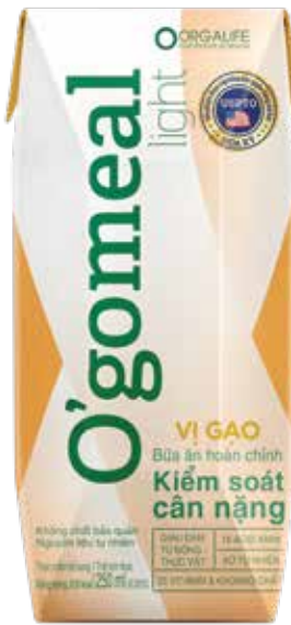
O'gomeal Light Rice Flavour Food Supplement