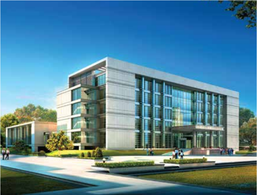
Investment project of Hi-Tech Research and Development Center.