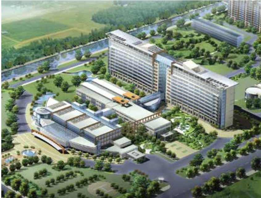
Investment project of Orgalife Nutritional Food Factory.