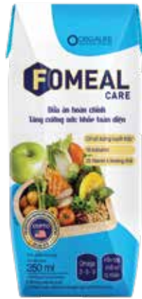
Fomeal Care Food Supplement