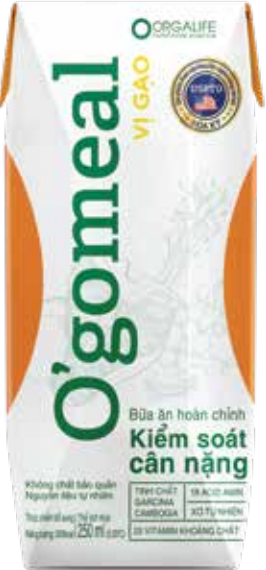
O'gomeal Rice Taste Food Supplement