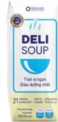
Delisoup Food Supplement