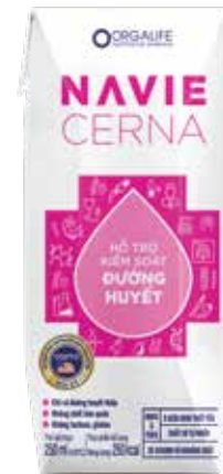
Navie Cerna Food Supplement