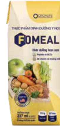
Fomeal Food for Special Medical Purposes