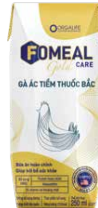
Fomeal Care Gold Black Chicken Food Supplement