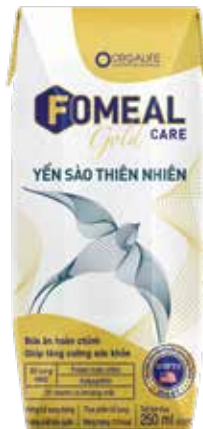
Fomeal Care Gold Bird's Nest Food Supplement